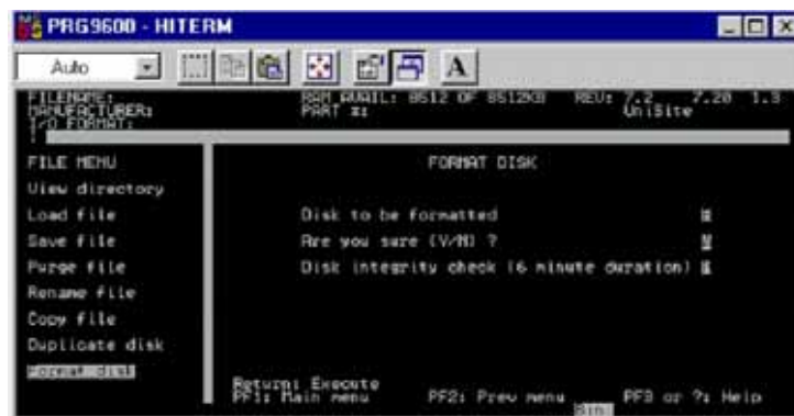
FORMAT DISK screen